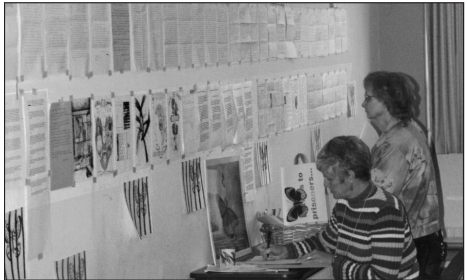
The letters quoted here were posted at the Imprisonment & Transformation conference.

How can a prisoner's heart "change" if prisons are nothing more than hate factories? Look how meditation softened and